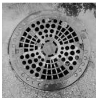
Figure 1: Drain on the path

Upon analysis of the photograph-task pairs, I found that the mathematical concepts identified by the teachers were dominated by the concepts of numeracy and geometry, even though there was potential for choosing other concepts as identified by the researcher. In geometry, tasks including basic two- and three-dimensional forms were dominant. Notably, none of the teachers identified, or chose to highlight, symmetry as mathematical concept.